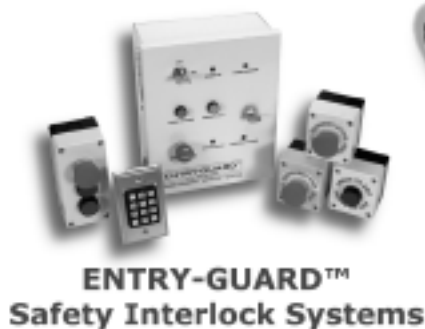
ENTRY-GUARD™ Safety Interlock Systems