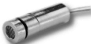
Laser Diode Modules