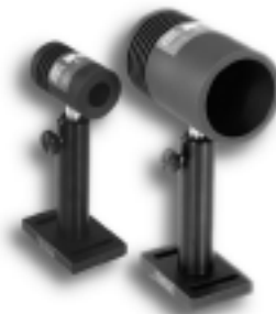
TRAP-IT™ Beam Dumps