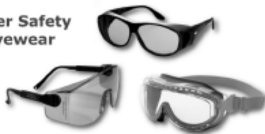
Laser Safety Eyewear