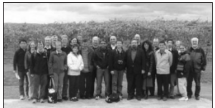
Several attendees stayed to enjoy the post conference tour which included a stop at a local winery.