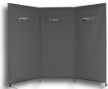
SERVICE-RIGHT™ Portable Barrier Systems