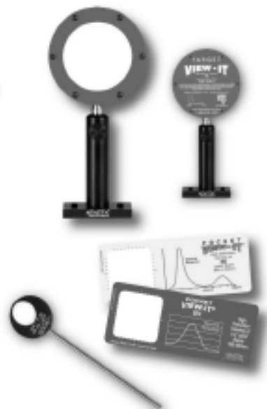
VIEW-IT™ IR & UV Detectors