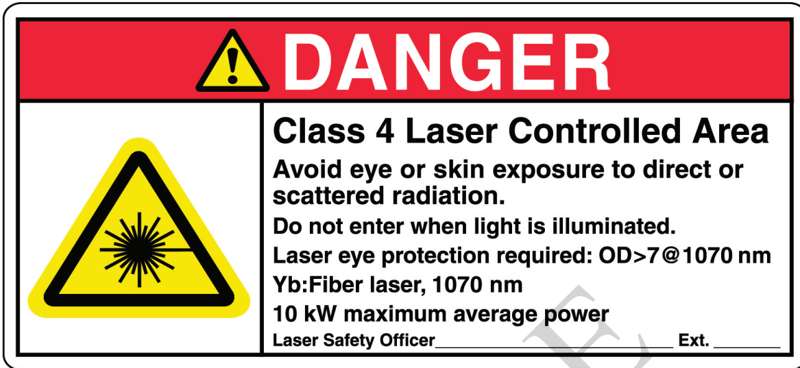
Figure 1c. Sample ANSI Z535.2 Compliant Class 4 Laser Controlled Area Danger Sign Format.