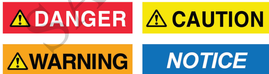
Figure 1d. ANSI Z535.2 Signal Words